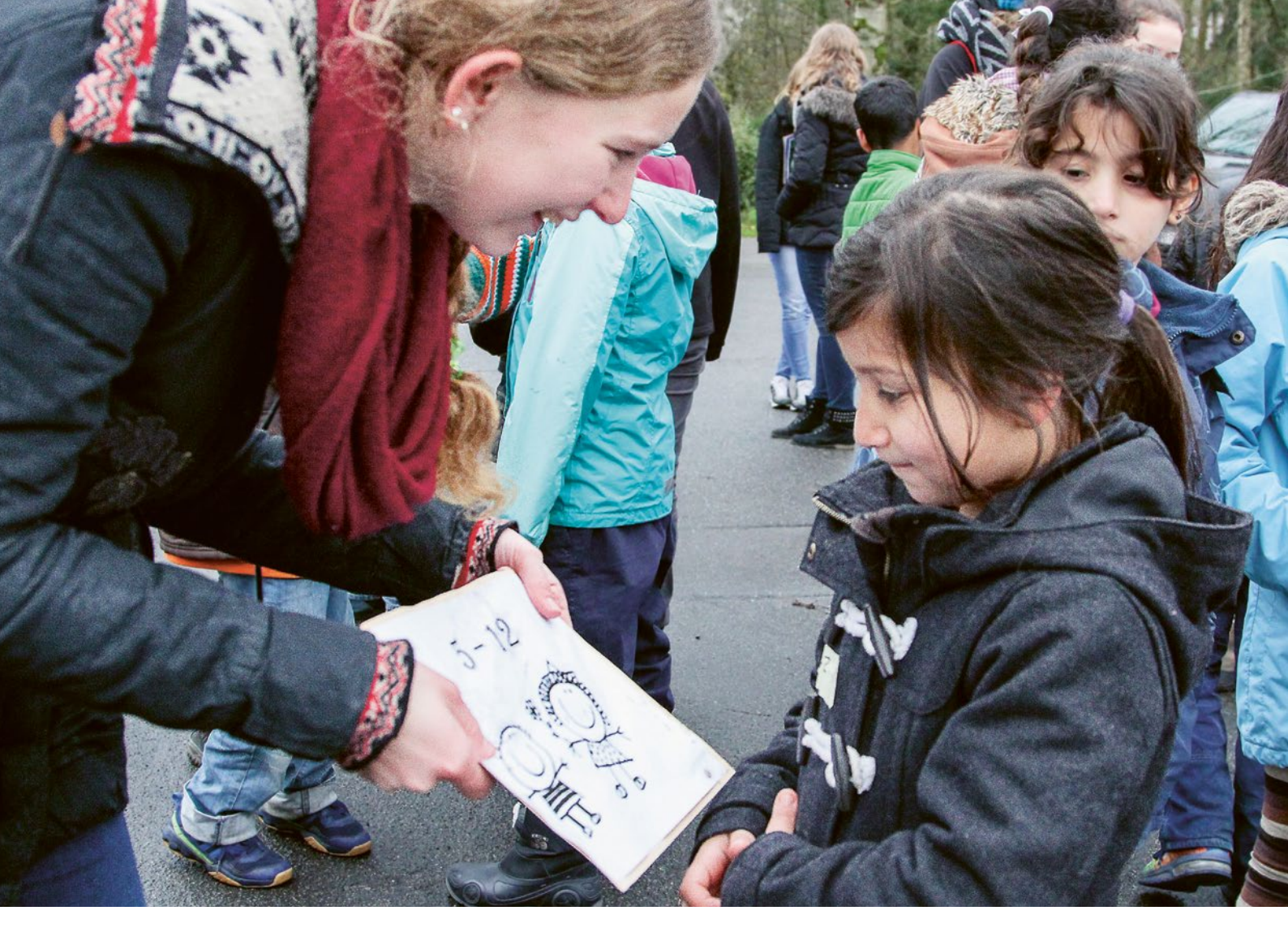
Excursion with refugee children: partner organisations implementing terre des hommes projects must also adhere to the child safeguarding policy