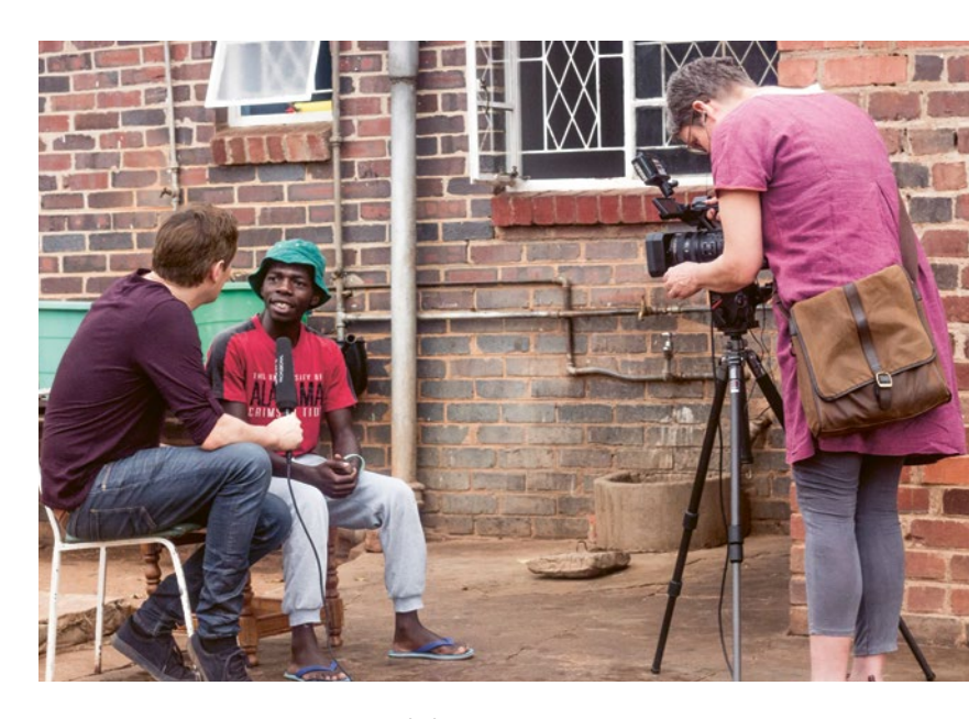
Interview in Zimbabwe: a former street child talks about his life

The consent and signed permission must be obtained from children and their parents or guardians before taking or publishing photos, or interviewing children.