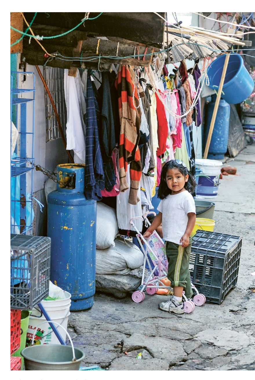
Authentic photos: terre des hommes uses pictures showing children in their life context, but not as victims

Compliance must be checked by the respective supervisors, project leaders, and country or regional coordinators. This shall happen at regular intervals (also through random checks). It there is no statement of consent to hand, the responsible terre des hommes staff member must obtain one subsequently or their immediate supervisor must clarify and settle the mat-