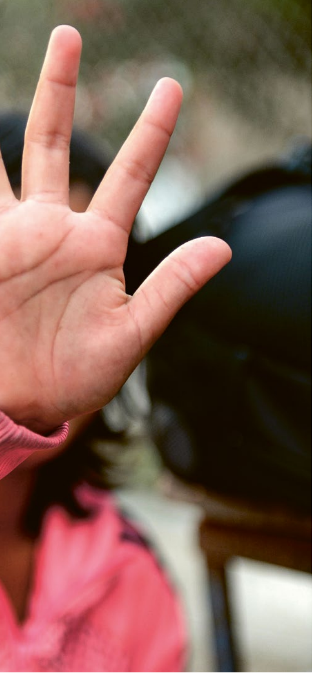
The child's welfare is our prime concern: we protect the identity of children affected by violation of their rights

The first individuals with a right to access data when a case is reported are the members of the Child Safeguarding Committee. If necessary, other external persons will be brought into the case. In the event of a report from abroad, the appropriate persons at the local level will be involved as well.