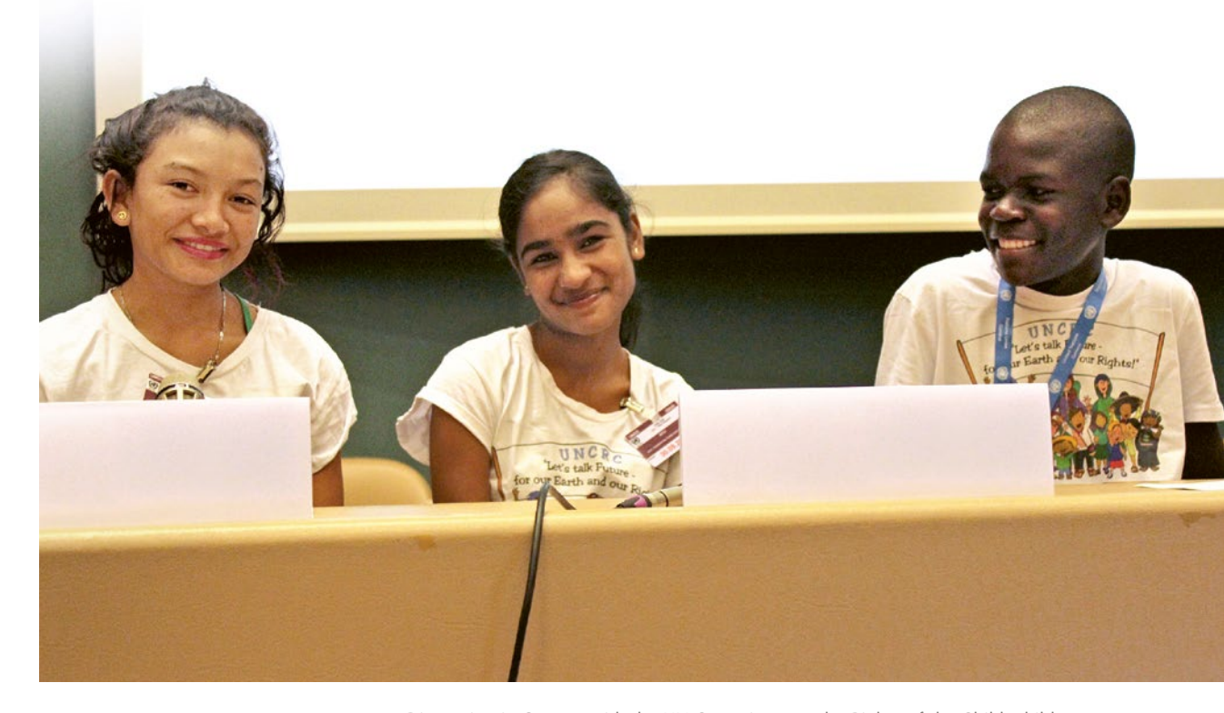
Discussion in Geneva with the UN Committee on the Rights of the Child: children from terre des hommes projects call for their right to a healthy environment

Interviews with children shall be conducted with age-appropriate and sensitive interview methods. If possible, they should be in the local language or with a person the child trusts as translator (e.g. a project partner, or family member). That will preserve the child's private sphere and makes them feel comfortable. The child may be accompanied to the interview by their parents, guardian or another person they trust. The interview is followed by a debriefing with the child. The interviewer goes over the core statements of the interview again with the child and tells them where and when it will be published. Whenever possible, the parents or guardian will also be notified about the way the interview went.